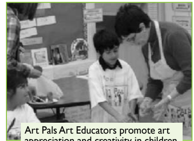
Art Pals Art Educators promote art appreciation and creativity in children

Starts curriculum and created a program to serve fourth-grade students. The new curriculum builds upon the lessons taught in the third-grade Art Pals program and was well-received by participating students and faculty at Reseda Elementary. During the upcoming school year, the Art Pals program will be offered to both third- and fourth-grade students at participating schools.