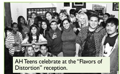
AH Teens celebrate at the "Flavors of Distortion" reception.