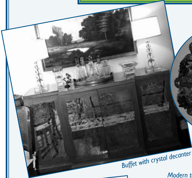
Buffet with crystal decanter