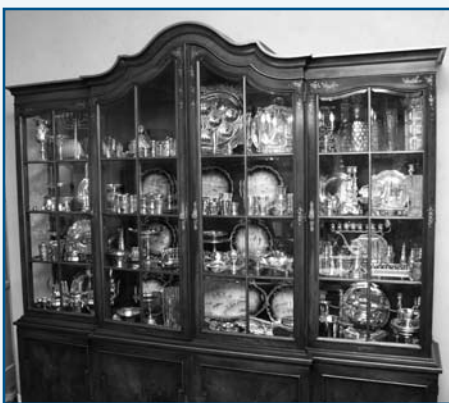
Grand buffet filled with sterling silver, porcelain, and crystal