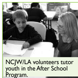
NCJW/LA volunteers tutor youth in the After School Program.