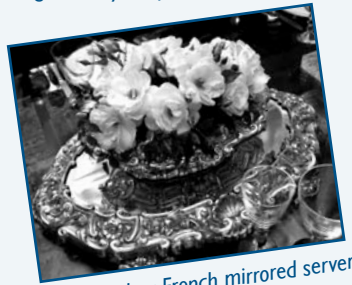
Sterling silver French mirrored server with sterling caviar bowl