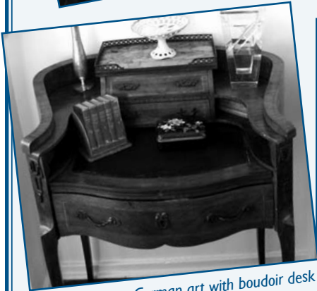
19th century German art with boudoir desk