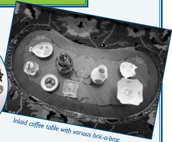
Inlaid coffee table with various bric-a-brac