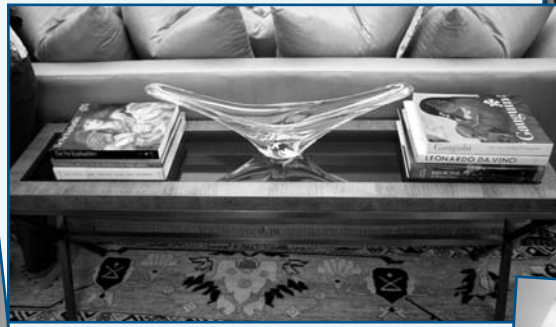
Modern table with glass Baccarat bowl