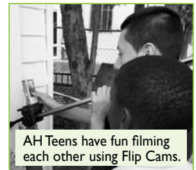
AH Teens have fun filming each other using Flip Cams.

This year, NCJW/LA and Alexandria House will be partnering with the Echo Park Film Center to guide the teens in creating their own film! While the theme of the film has not been determined at this time, the teens are eager to learn and engage in the process of writing, directing, and producing a film. Stay tuned for details regarding the premiere!