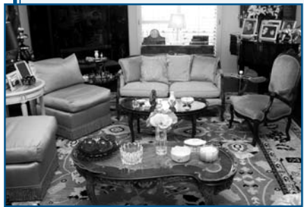
Living room by Thrift