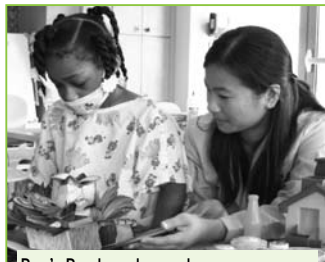
Ben's Books relax and engage a young patient while she receives treatment.