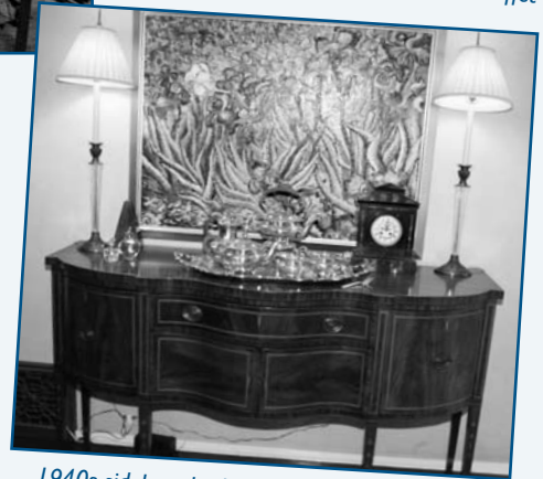
1940s sideboard table with two crystal lamps