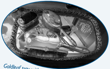
Goldleaf tray with women's beauty set and pearl necklace with 14k gold watch