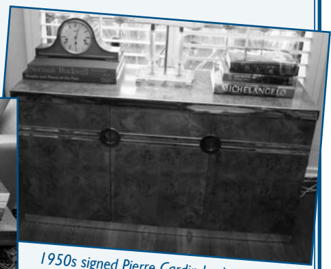
1950s signed Pierre Cardin burlwood buffet